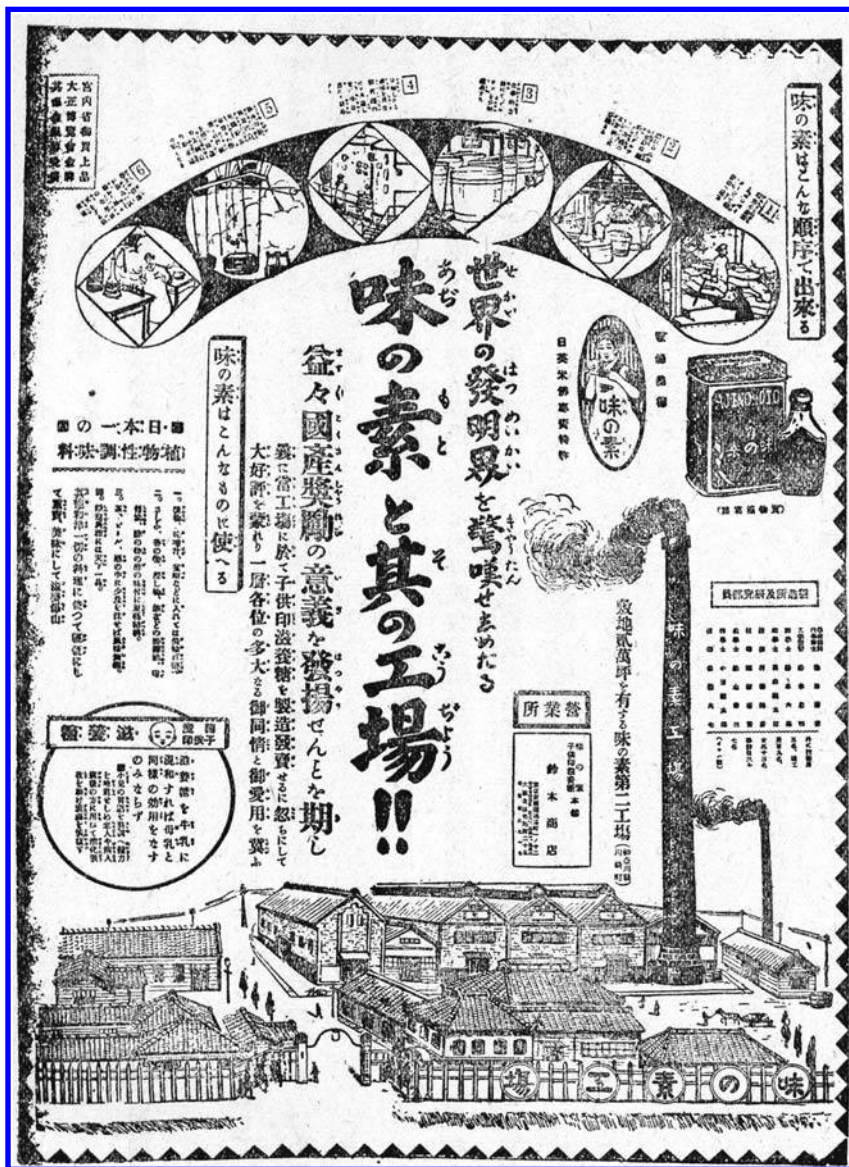
Above: “The Invention that Astounded the World! Ajinomoto and the Ajinomoto Factories!!” (1915). From Ajinomoto kabushiki gaisha shashi [Company History of Ajinomoto Incorporated] (Ajinomoto kabushiki gaisha, 1971), volume 1.

of the century. A new domesticity was emerging as a critical component of class identity for the elite who had come to dominance under the tutelage of the Meiji state. The enlightened bourgeois housewife sought to manage her kitchen according to the precepts of hygiene, Taylorist efficiency, and scientific nutrition. To do so, she was exhorted to take on all the tasks of food preparation herself, since the well-being of her family could not be entrusted to ignorant servants. Many bourgeois women embraced their new role in the kitchen, enthusiastically taking up the challenge to concoct new and nutritious meals daily as a way to please their families and a means to personal fulfillment. In this, they broke with a long tradition of kitchen work characterized by seasonal cycles of production and heavy tasks involving multiple hands. Thus, twentieth-century Japanese women whose mothers had learned to cook from their mothers—or whose mothers had only overseen the household accounts and allowed servants to do the actual cooking—consumed